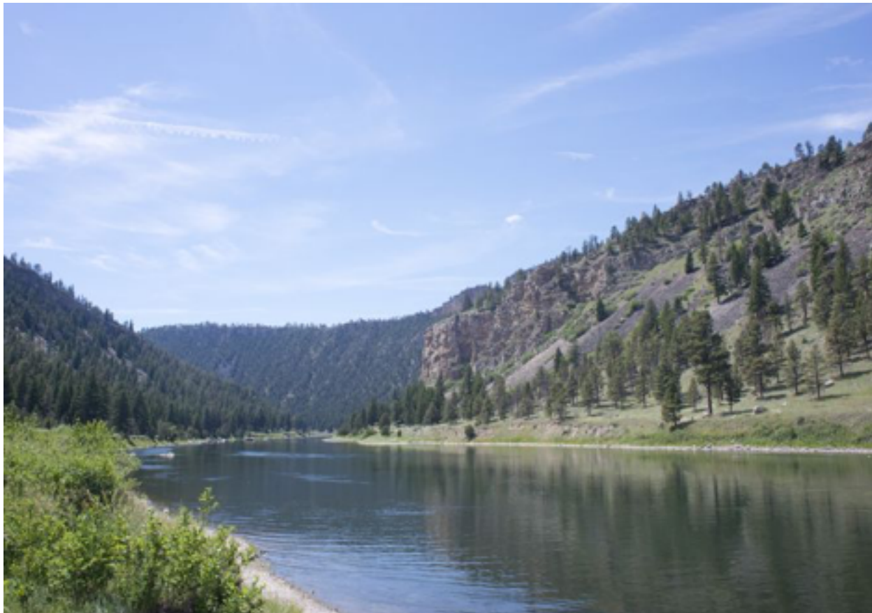
1. Missouri River, 2341 miles. Begins in Montana, ends at the Mississippi River in Missouri.