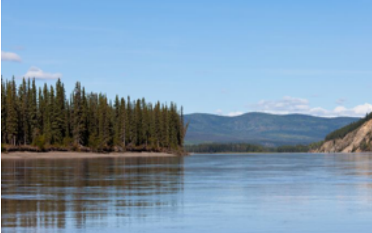
3. Yukon River, 1979 miles. Begins in Canada, ends in the Bering Sea in Alaska.