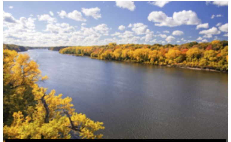
2. Mississippi River, 2202 miles. Begins in Minnesota, ends in the Gulf of Mexico in Louisiana.